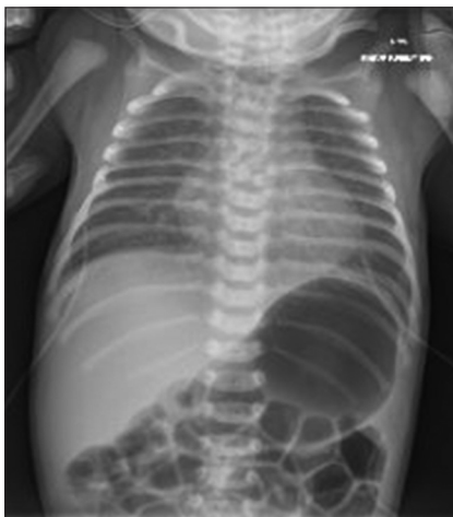
Figure 1: Abdominal X-ray demonstrating nasogastric tube curled in esophagus and stomach distended with air

We have reported a patient with a rare case of H-type TEF who developed post-operative hypertrophic