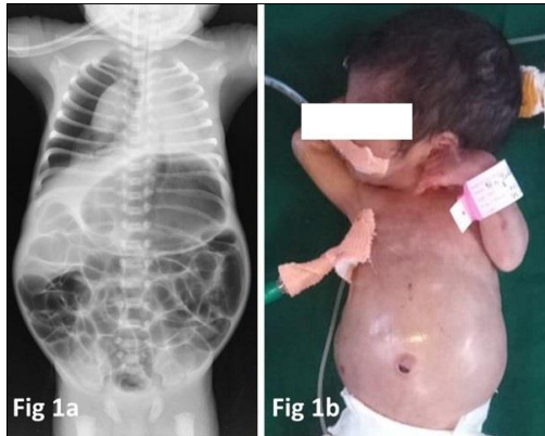
Fig.1a. Right pneumothorax with grossly distended stomach with splinting of diaphragm and Fig.2b. Intubated neonate with grossly dilated stomach and Rt ICD.

kg with EA/TEF was transported on ventilatory support to our institution at three days of age. The baby developed poor chest rise, desaturation, and bradycardia due to a large air leak into the stomach through the fistula. Initial attempts by adjusting the position of the ETT failed. Further attempts by changing the ETT and subsequently with a large volume low pressure cuffed tube as well as replacing the Replogle tube ended up in pneumothorax (Fig.1).