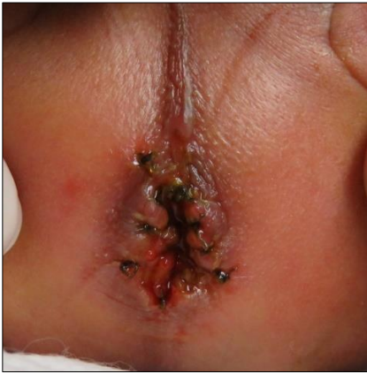
Figure 1. Early dehiscence of a simple anoplasty, >25% of total circumference, requiring additional stitches.

nificant) using Microsoft Office Excel Software v. 1904 (Richmond, VA, USA). Partial anoplasty dehiscence was defined as < 25% of total neoanus circumference without the need of additional stitches, while “total” was defined as > 25% dehiscence requiring stitches (Fig. 1). Superficial perineal dehiscence was defined as separation of only skin borders without need for additional stitches, while deep perineal dehiscence as a dehiscence deeper than hypodermis layer requiring additional stitches.