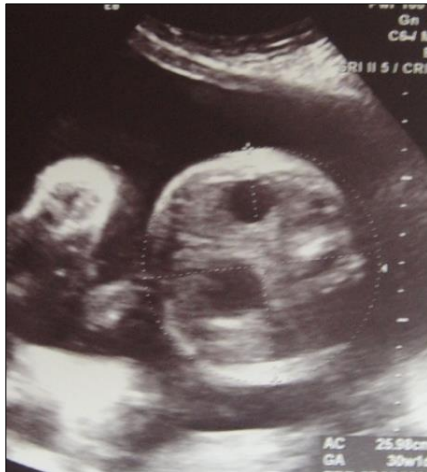
Figure 1: USG- showing fetal double bubble sign with polyhydramnios.

Antenatal Diagnosis: Though majority of the pregnancies were supervised, an antenatal diagnosis of duodenal obstruction on ultrasonography (Fig. 1) was made in only two patients. One mother was diagnosed to have polyhydramnios.