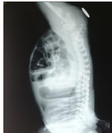
Figure 1: Invertogram showing high variety ARM.

follow up was done 10 days after surgery and the baby was doing fine.