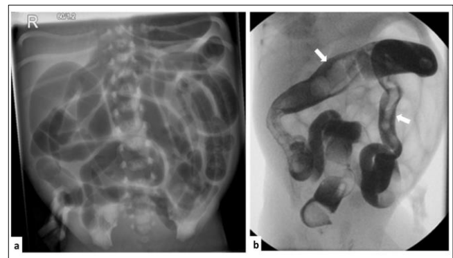
Figure 1: (a) Plain abdominal radiograph of preterm with FIOF showing generalised bowel distension. (b) Meconium plugs, shown as filling defects (arrows) in the non-distended colon and terminal ileum are seen on the contrast enema study.

Plain radiographs typically show features of lower intestinal obstruction with multiple dilated loops. The gas pattern is usually generalised and symmetrical with no air-fluid levels as opposed to features seen in mechanical obstruction (Fig.1). Pneumatosis, fixed bowel loop, and portal gas which are characteristic of NEC are absent. Clinical findings and plain x-ray are often sufficient to make a diagnosis and institute management especially in the ELBW cohort that may require cardio-respiratory support.[12]