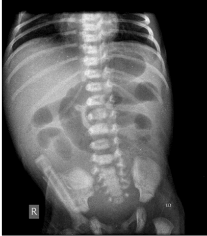
Figure 1: X-ray abdomen showing features of small intestinal obstruction

with the diagnosis of small bowel obstruction. On laparotomy, there was an acutely inflamed appendix that had formed bowel adhesions and encircled a loop of small intestine causing complete small bowel obstruction with partial ischemia and bluish discoloration of the intestine (Fig.2 A, 2B).